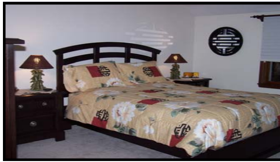
The Asian room is the largest with Japanese artwork and a private bath with a shower and a Jacuzzi tub. This room looks to the woods.