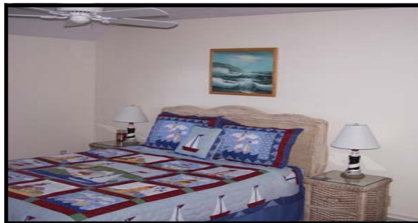
Our Lake room has nautical artwork and private bath with a large shower. This room overlooks the lake.