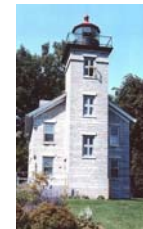
Old Sodus Lighthouse

We are also a short drive to wineries, farms and many other things to do in this beautiful area of New York.