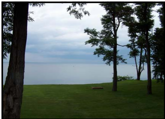
View from the deck as the sun goes down