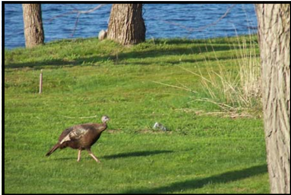
Lakeside in spring