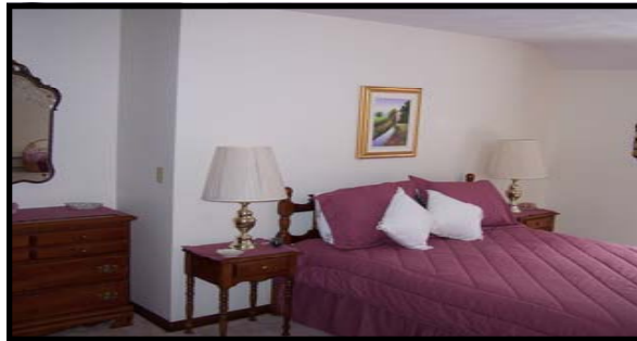
The English room has an English feel and a private bath with a tub/shower. This room also looks to the woods.