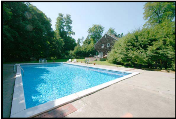
25' x 50' Pool