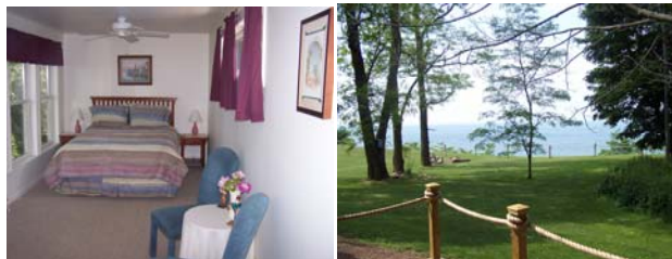
Our Cabana has a private bath with a large shower. This room overlooks the lake and is next to the pool. The Cabana also has its own deck overlooking the lake

All rooms need to be reserved in advance and guaranteed by credit card. Due to the size and popularity, a first night deposit is required. All reservations canceled will be charged one night. If we are able to re-book the room we will only charge a $25 cancellation fee.