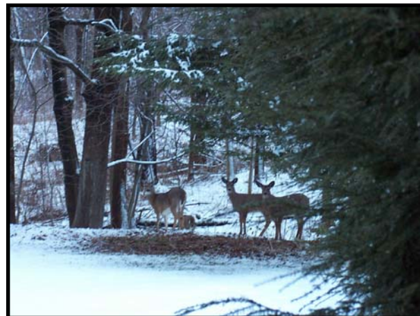
Woods in the winter

7961 Lake Road Sodus Point, New York 14555 USA